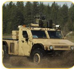
Unmanned Vehicle Control

The VG440 combines highly-reliable MEMS gyros and accelerometers with high-speed DSP electronics to provide a fully stabilized vertical gyroscope in a small and rugged environmentally-sealed enclosure. The VG440 provides consistent performance in challenging operating environments and is user-configurable for a wide variety of applications