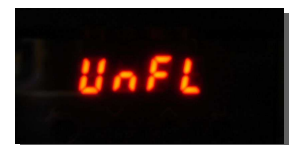
Under- and overflow indication