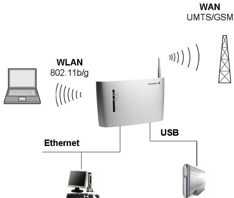
Figure 1 - Overview of Interfaces for the Ericsson W20/W21

The Ericsson W20/W21 provide data capabilities such as data access (e.g. Internet) in the respect that it allows multiple computers to be connected to the terminal using Ethernet or wireless LAN (WLAN).