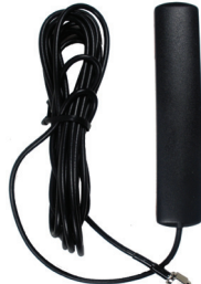
Antenna Type Code "03"

WAN02RSP tilt & swivel design, 2.2 dBi gain, direct mount connector