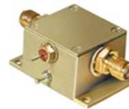
CASE STYLE: EEE132