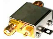
CASE STYLE: GC957