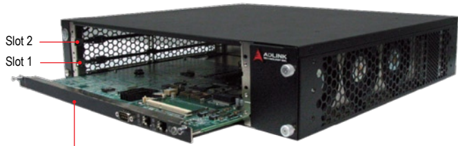
Shelf Management Hub with Layer 2 GbE switch for Base Interface connectivity