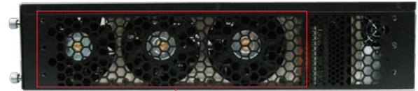
Front access, hot-swappable fan tray