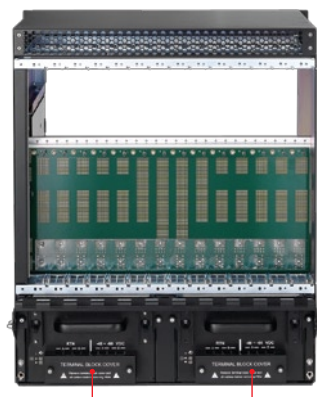
Rear View Power Entry Module (PEM)