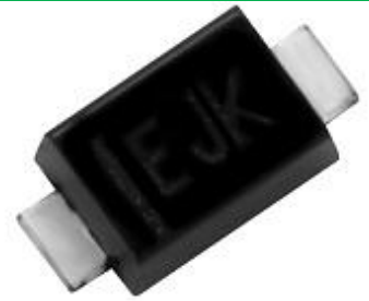
Package: SMF / SOD-123FL