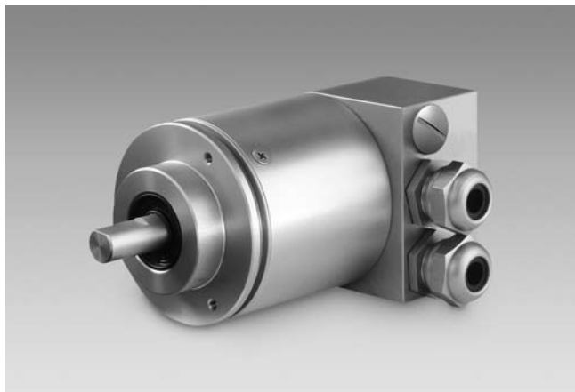
GEMMW with modular bus cover